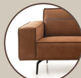
straight arm flat back cushion