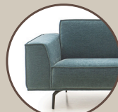
slanted arm drawn in back cushion