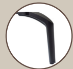
NNA black or metal look

HEIGHT: 82 cm DEPTH: 95 cm SEAT DEPTH: 58 cm SEAT HEIGHT: 47 cm ARM HEIGHT: 65 cm