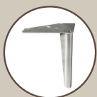
NNE black or alu

HEIGHT: 82 cm DEPTH: 95 cm SEAT DEPTH: 60 cm SEAT HEIGHT: 45 cm ARM HEIGHT: 65 cm